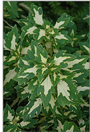
ColorBlaze Alligator Tears Coleus foliage