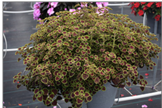
Burgundy Wedding Train Coleus