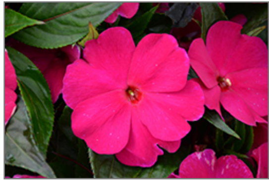
Magnum Purple New Guinea Impatiens flowers

Magnum Purple New Guinea Impatiens is recommended for the following landscape applications;