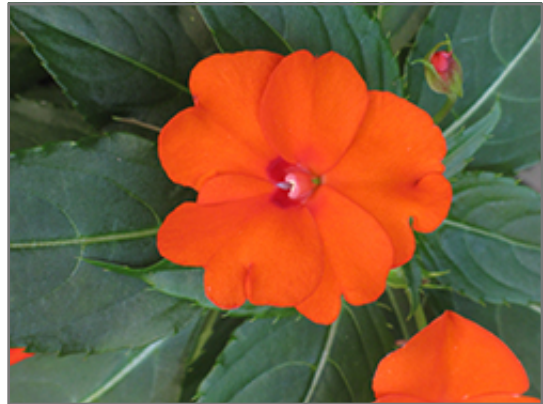
Infinity Orange New Guinea Impatiens flowers

Infinity Orange New Guinea Impatiens is recommended for the following landscape applications;