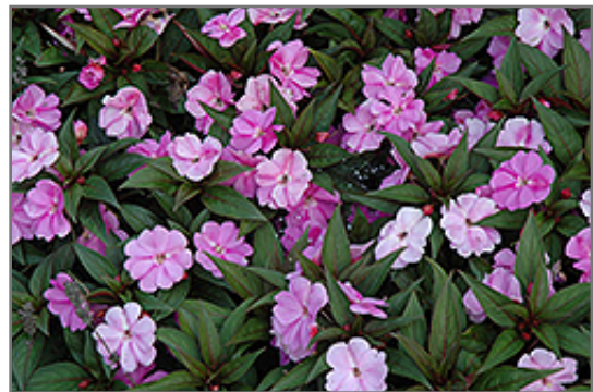
Divine Lavender New Guinea Impatiens flowers