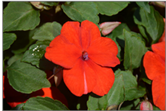
Super Elfin XP Scarlet Impatiens flowers

Super Elfin XP Scarlet Impatiens is recommended for the following landscape applications;