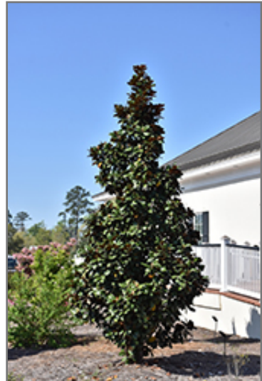
Teddy Bear Magnolia