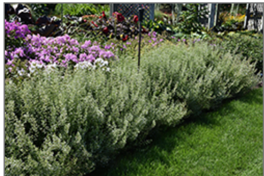
Montrose White Dwarf Calamint in bloom