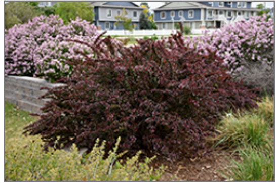
Red Leaf Japanese Barberry

Red Leaf Japanese Barberry is recommended for the following landscape applications;