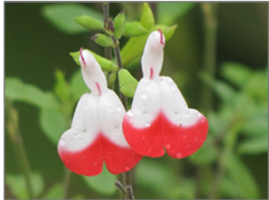
Hot Lips Sage flowers

Hot Lips Sage is an herbaceous evergreen perennial with an upright spreading habit of growth. Its relatively fine texture sets it apart from other garden plants with less refined foliage.