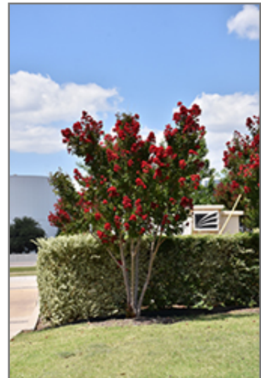
Dynamite Crapemyrtle in bloom