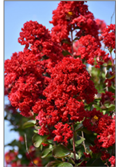
Dynamite Crapemyrtle flowers