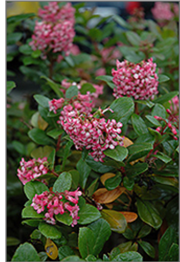
Newport Dwarf Escallonia flowers

Newport Dwarf Escallonia is recommended for the following landscape applications;