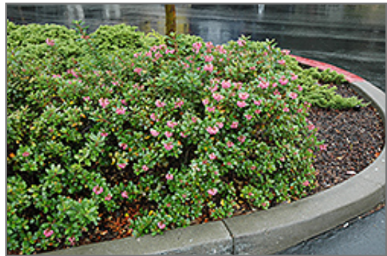
Newport Dwarf Escallonia in bloom