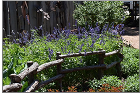
Mealy Cup Sage in bloom